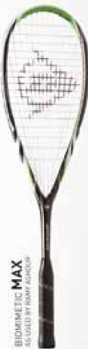
BIOMIMETIC MAX AS USED BY RAFAY ADJOUA

WEIGHT: 130g HEAD: 500cm 2 BALANCE: X-HEAD LIGHT CODE: 773053