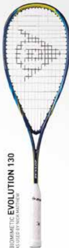
BIOMIMETIC EVOLUTION 130 AS USED BY NICK MATTHEW

WEIGHT: 130g HEAD: 490cm 2 BALANCE: HEAD LIGHT CODE: 773001