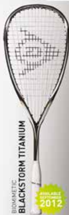
BIOMIMETIC BLACKSTORM TITANIUM

WEIGHT: 135g HEAD: 500cm 2 BALANCE: HEAD LIGHT CODE: 773013