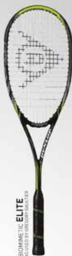
BIOMIMETIC ELITE AS USED BY GREGORY GAULTIER

WEIGHT: 135g HEAD: 500cm 2 BALANCE: EVEN CODE: 773003