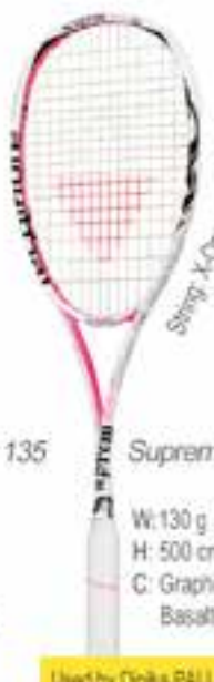
Suprem Ruby 130

W:135 g H: 500 cm 2 C: Graphite / Basaltex Hybrid