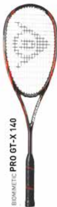
BIOMIMETIC PRO GT-X 140

WEIGHT: 140g HEAD: 470cm 2 BALANCE: EVEN CODE: 773005