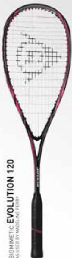
BIOMIMETIC EVOLUTION 120 AS USED BY MADRIDALC PENNY

WEIGHT: 120g HEAD: 490cm 2 BALANCE: HEAD LIGHT CODE: 773002