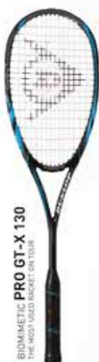
BIOMIMETIC PRO GT-X 130 THE MOST USED RACKET ON TOUR

WEIGHT: 130g HEAD: 470cm 2 BALANCE: EVEN CODE: 773004