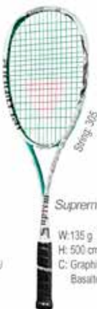
Suprem Calibur 135

W:135 g H: 500 cm 2 C: Graphite / Basaltex Hybrid