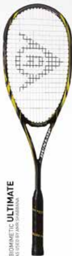
BIOMIMETIC ULTIMATE AS USED BY ANDRÉ AGUASSI

WEIGHT: 132g HEAD: 500cm 2 BALANCE: EVEN CODE: 773000