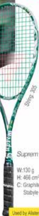
Suprem NG 130

See www.tecnifibre.com for full luggage range